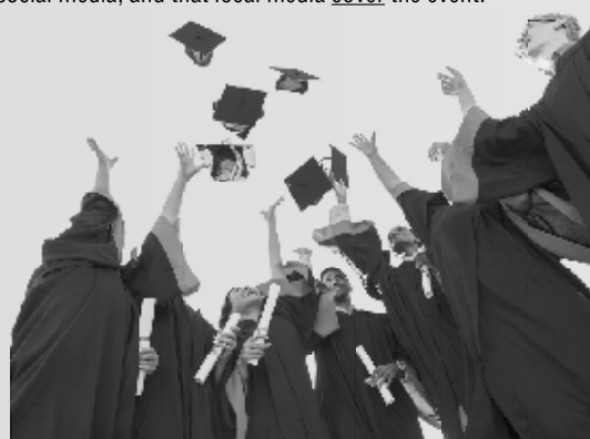
Events to remember

(8) ..... its first graduation ceremony to publicise the university's courses and attract new students.